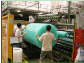
REVERTE added at manufacturing