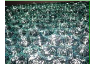
FINISHED PRODUCT Ready for application (shelf life approx 18 months)

Polycell's Oxo-B Eco Bubble incorporating 'Reverte' Oxo-biodegradable masterbatch is the result of running numerous trials using a wide range of additives over a long period of time.