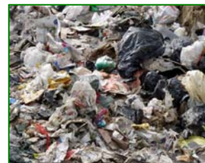
INPUT INTO LANDFILL SYSTEM (start of degradation)