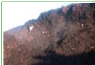
COMPLETION OF DEGRADATION (only Biomass, CO 2 & H 2 O remain)

Then with the help of the unique additives, degradation is complete leaving only Biomass, CO 2 and H 2 O